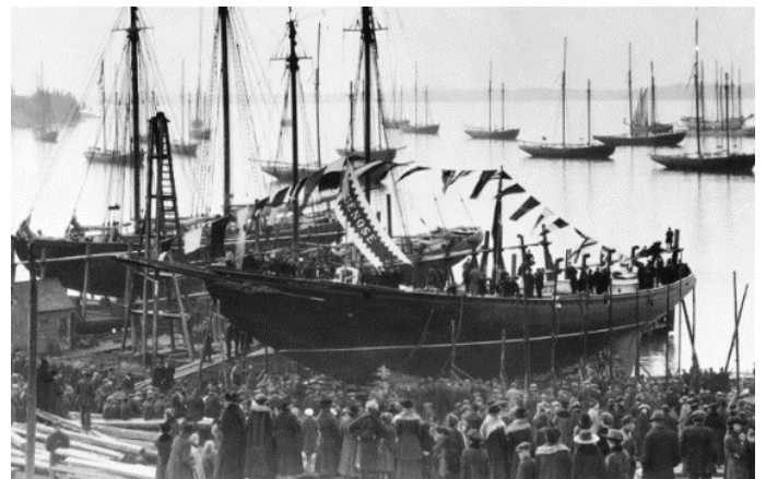
Bluenose launch - March 26 at Lunenburg Harbour

And a bright hope in 1921; a fishing and racing rig schooner named Bluenose was built. She became a provincial icon for Nova Scotia and an important Canadian symbol in the 1930s. The new schooner was launched from Lunenburg's Smith and Rhuland's master shipwrights at a cost of $35,600.