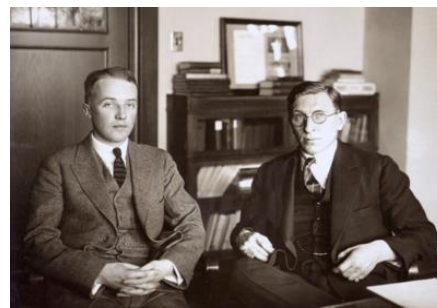
Best and Banting, c. 1924

In July, Frederick Banting announces the discovery of the hormone insulin. Banting sets up his medical practise in London and taught at Western University.