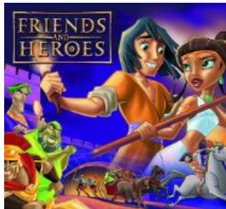
FRIENDS AND HEROES